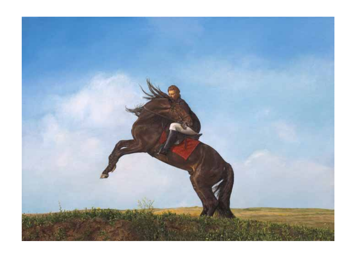
13. Backlash 2012 OIL ON CANVAS 50.5 × 70.5 cm