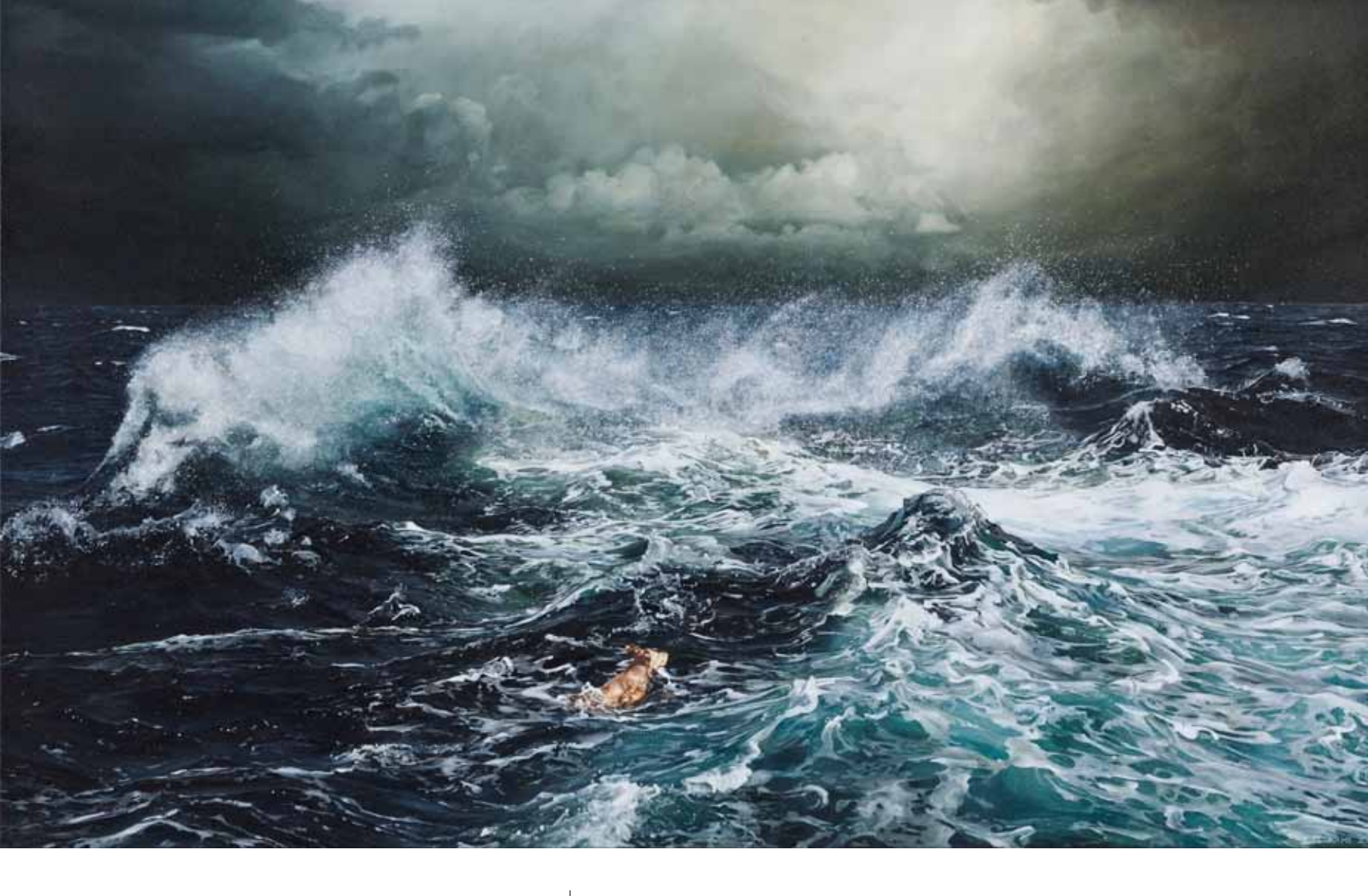
7. On the scent 2011 OIL ON CANVAS 54 \times 87 cm