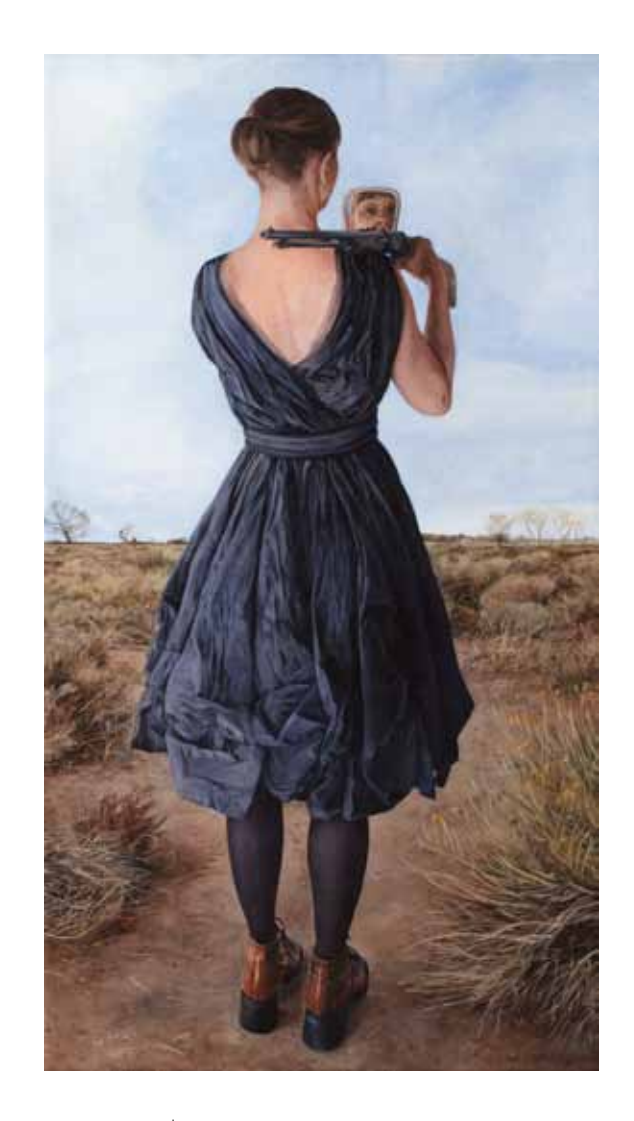
17. Sharpshooter (Study) 2013 OIL ON CANVAS 55 \times 30 cm