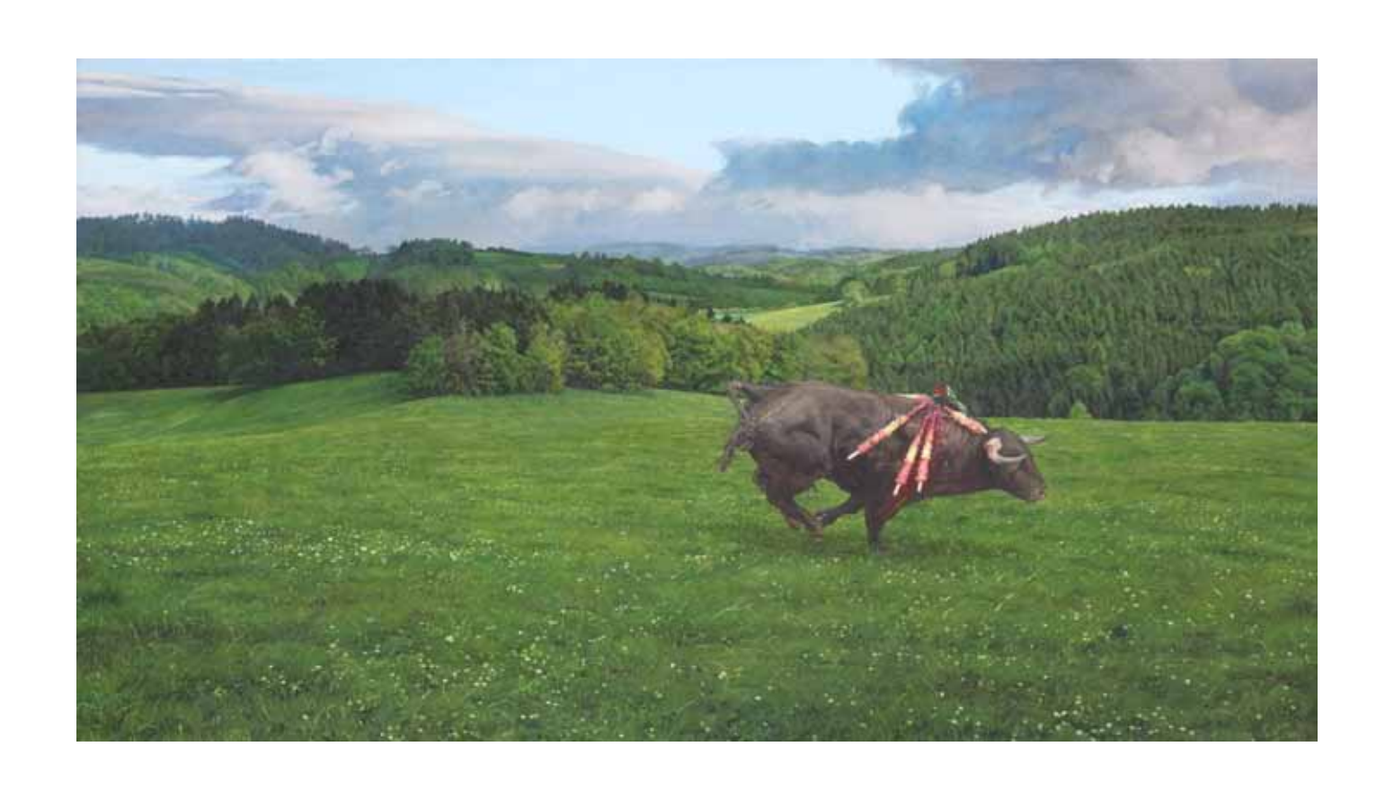
12. Win and lose 2011 OIL ON CANVAS 46.5 \times 84.5 cm