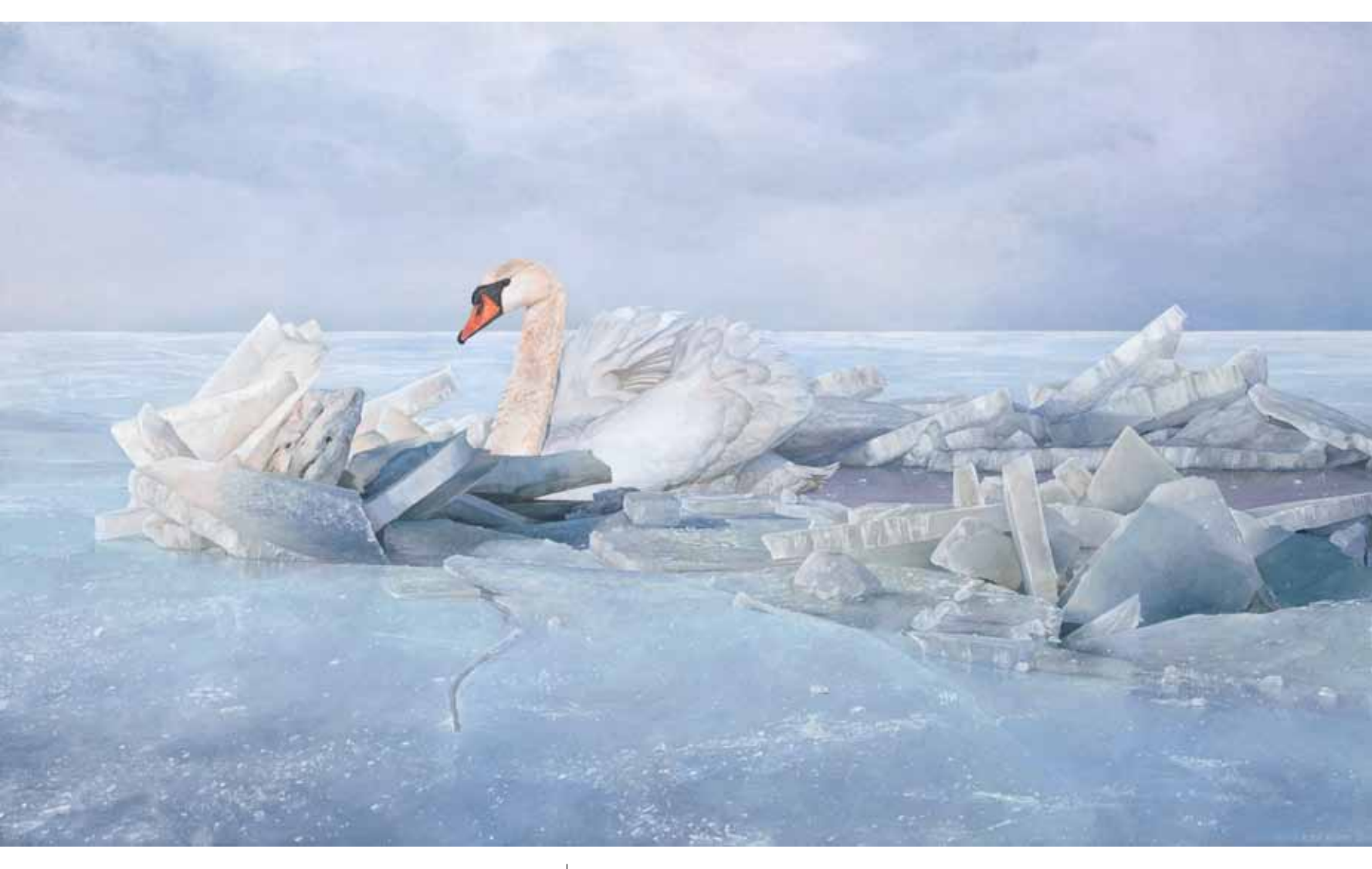
10. Icebreaker 2014 OIL ON CANVAS 49.5 \times 83.5~\mathrm{cm}