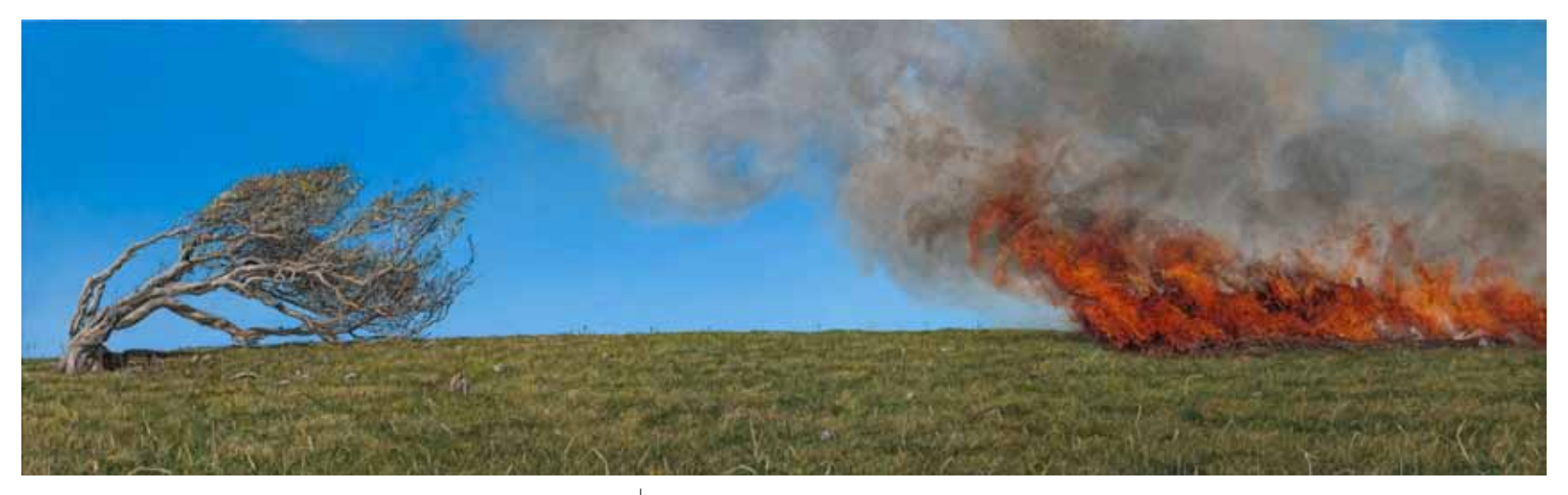
14. Wind shift 2013 OIL ON CANVAS 30.5 × 100.5 cm