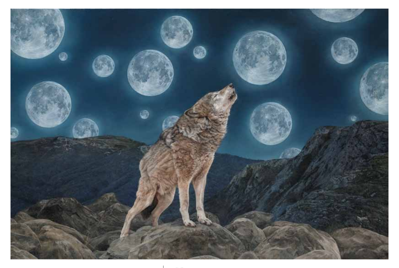
15. Full moon 2012 OIL ON CANVAS 39.5 \times 63.5 cm